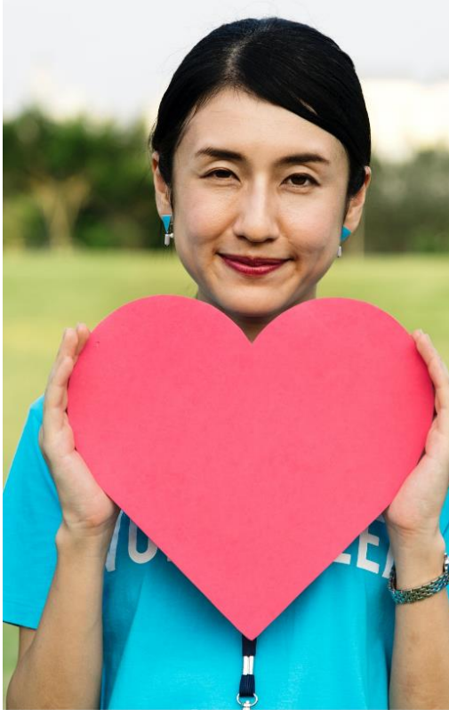
Insert: Caption here and photo above.

Include a client/supporter quote here that aligns with the compelling participant story shared under “What We Achieved.”