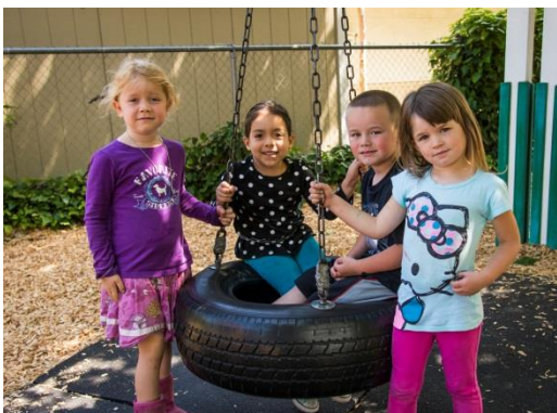
Insert: Top photo & above photo captions.

Briefly describe the strategies you will use to strengthen, sustain and/or scale your program over the next 2 years. Don’t forget to mention important community partnerships. Briefly mention new goals, anticipated results, and any program improvements you plan to make. Close with a “call-to-action” by mentioning resources, including additional funding, personnel or community partnerships that your program needs to continue to be successful. This section helps current and potential funders and partners understand your needs and next steps.